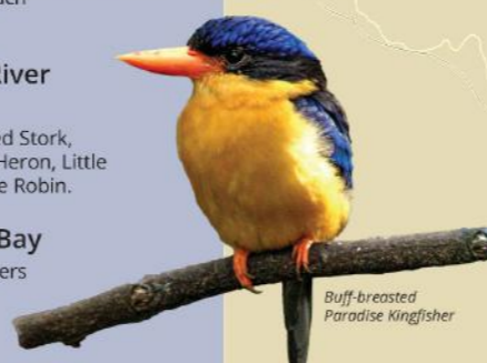
Buff-breasted Paradise Kingfisher