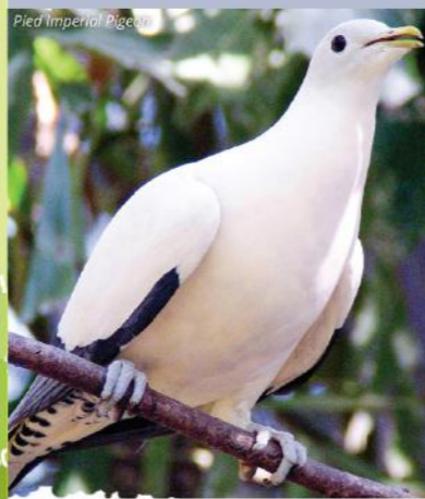
Pied Imperial Pigeon