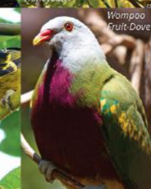
Wompoo Fruit Dove